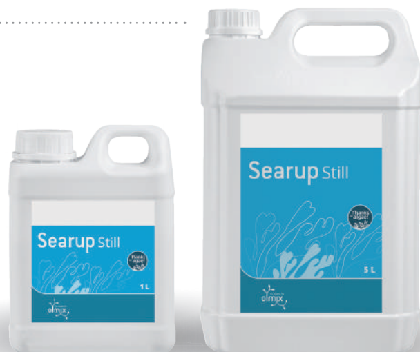
Cans of 1 and 5 liters